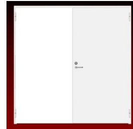
Sash type XS

Door must be checked and maintained at least in every six months. Check closing of door and operation of locking elements. Detailed information is available in maintenance manual. It is possible to sign a maintenance contract upon purchasing the door.